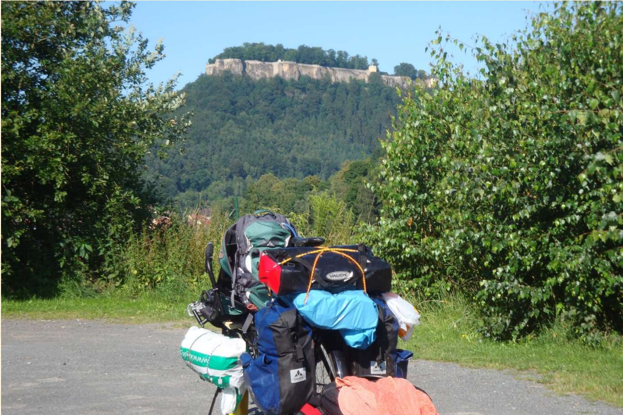
Following next: Czech Republic